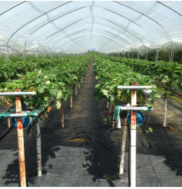
Fig.1 Strawberry crops planted in pots and put in drain water channels as well as in Hors-Sol cultures

The Vogel family produces strawberries, raspberries, blackberries and blueberries in high quality, of with a good portion is sold at the own farm shop. The strawberries are produced either in pots placed in drain water channels, or with the Hors-Sol method (Fig.1).