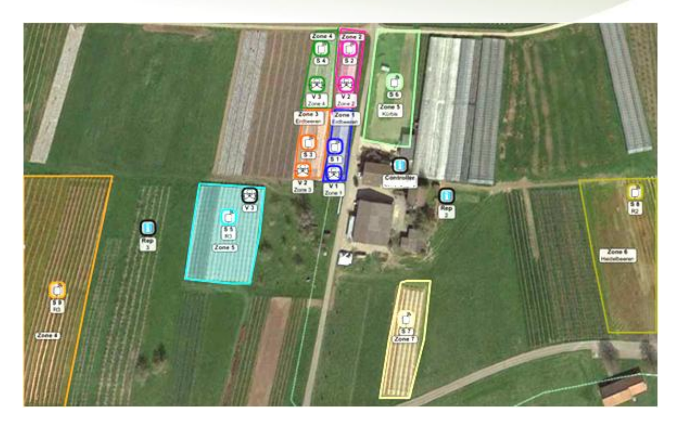
Fig.2: Arrangement of the irrigated areas, the sensors, valves and radio repeaters

In 2012, Mr. Vogel has decided to invest in a PlantControl CX irrigation computer, since the irrigation monitoring of different cultures with different water demand required a great deal of his time. Due to the very positive experiences during 2013, further beery fields which are farther away from the farm were integrated in 2014 into the automatic irrigation control by means of radio repeaters.